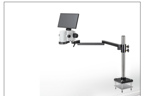
KERN OIV 902: Universal stands with hinged arm for screw onto a bench surface