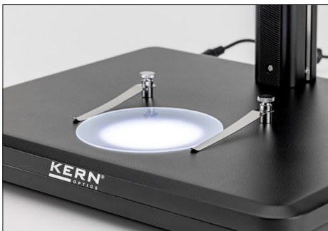
NEW: KERN OIV 355 Stand with combined incident- and transmitted-light illumination

The entry level video microscope with bright image reproduction and intuitive operation