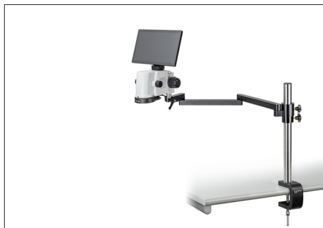
KERN OIV 901: Universal stands with hinged arm for clamping onto the edge of the bench